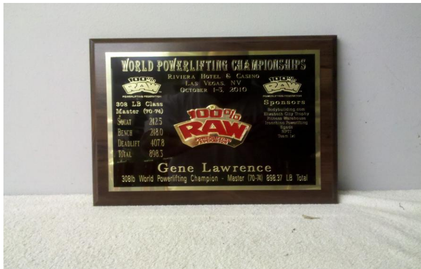
Custom World Championship Plaque – Last time offered

Any lifter can purchase a Record, Ranking or Personal accomplishment plaque from our website by printing off an order form and faxing or e-mail back. E-mail to ectrophy@aol.com or fax it to: 252-338-7669. Please fill out very neatly (prefer typing). Elizabeth City Trophy & Awards accepts Master Card, Visa and Discover. You can send in your form and give a telephone number for them to call you for payment type or you can e-mail or fax the information if you prefer. The newly created World Championship Plaque is available for any lifter who competed in either World event in 2010. Below is a picture of this plaque.