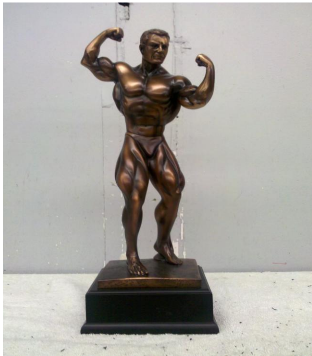
New massive Bodybuilding sculpture for NASF Carolina Open April 9 th in Elizabeth City, NC. The overall trophy will be approximately 6 foot tall with 22” Sculpture on top.