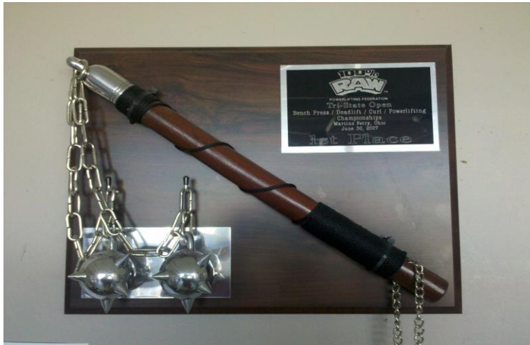
Award for the “Battle of the Border” on March 26 th in Currituck, NC. Some will be mounted with daggers and some with Axes. Pictured is a mace.