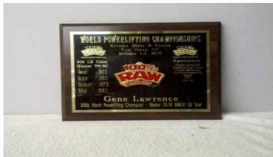
Newly Created World Championship Plaque March only “Special $50”

Any lifter can purchase a Record, Ranking or Personal accomplishment plaque from our website by printing off an order form and faxing or e-mail back. E-mail to ectrophy@aol.com or fax it to: 252--338-7669. Please fill out very neatly (prefer typing). Elizabeth City Trophy & Awards accepts Master Card, Visa and Discover. You can send in your form and give a telephone number for them to call you for payment type or you can e-mail or fax the information if you prefer. The newly created World Championship Plaque is available for any lifter who competed in either World event in 2010. Below is a picture of this plaque.