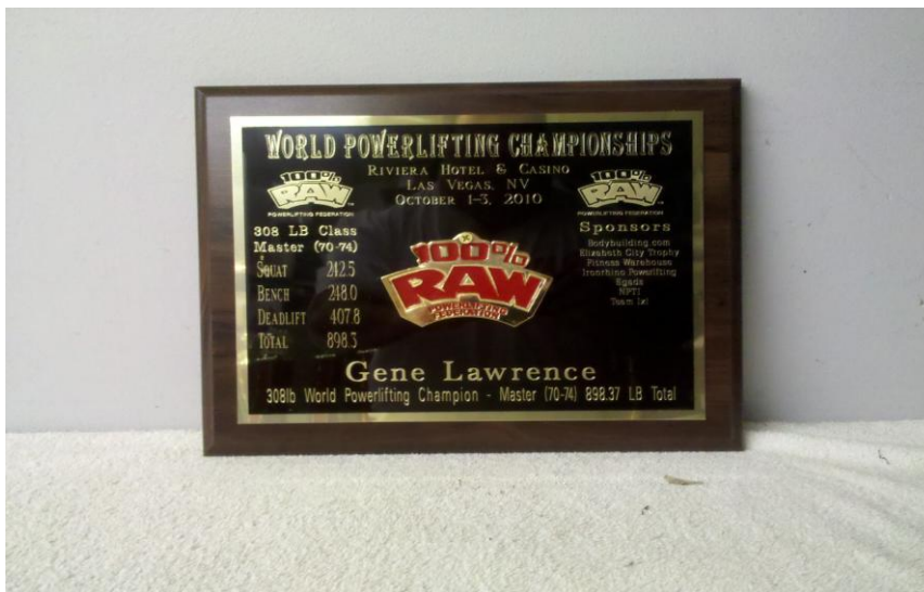
Custom World Championship Plaque – Last time offered

Any lifter can purchase a Record, Ranking or Personal accomplishment plaque from our website by printing off an order form and faxing or e-mail back. E-mail to ectrophy@aol.com or fax it to: 252-338-7669. Please fill out very neatly (prefer typing). Elizabeth City Trophy & Awards accepts Master Card, Visa and Discover. You can send in your form and give a telephone number for them to call you for payment type or you can e-mail or fax the information it if you prefer. The newly created World Championship Plaque is available for any lifter who competed in either World event in 2010. Below is a picture of this plaque.